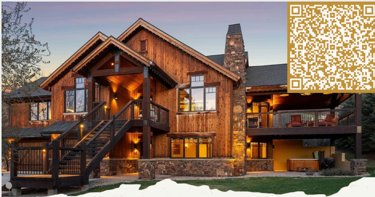
Photo: Park City, Utah Getaway

More at https://bit.ly/FBEFBites4BrightFutures .